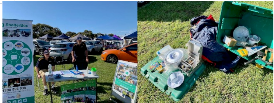
Shelter Box Display

You receive an email each week asking about your attendance at the next meeting - please respond when you get it - it's a very simple process. You will receive a return email advising your response has been registered.