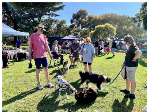
Gathering of the Dogs