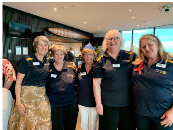
Some of the willing workers who made the night go so smoothly.