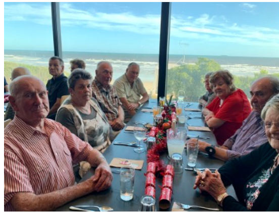
Our guests enjoyed a wonderful venue, excellent food and a great night out.

Where you can use your OGBA voucher: Driftwood Cafe, OG Cellars, Ian Pattison Jewellers, Piping Hot Chicken Shop, Viewpoint Digital Media, OG Bar, Wardrobe by the Sea, Bellarine Eye care, Bay IT, Bells by the Beach, Laminar, Wish Fish, OG Hardware, OG NewsXPress, Pavilion Property, Ocean Eyes, OG Super Toys, Covenant Wine Bar, Roche Accounting, Bakers Delight