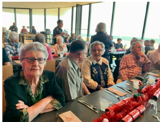
More of our guests enjoying the Christmas spirit.