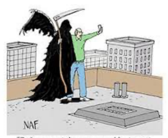
"Before you take me away, I just want to update my profile picture."