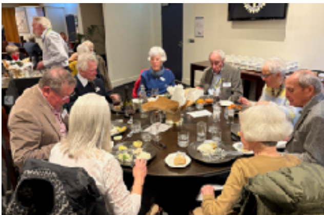
Life members & partners