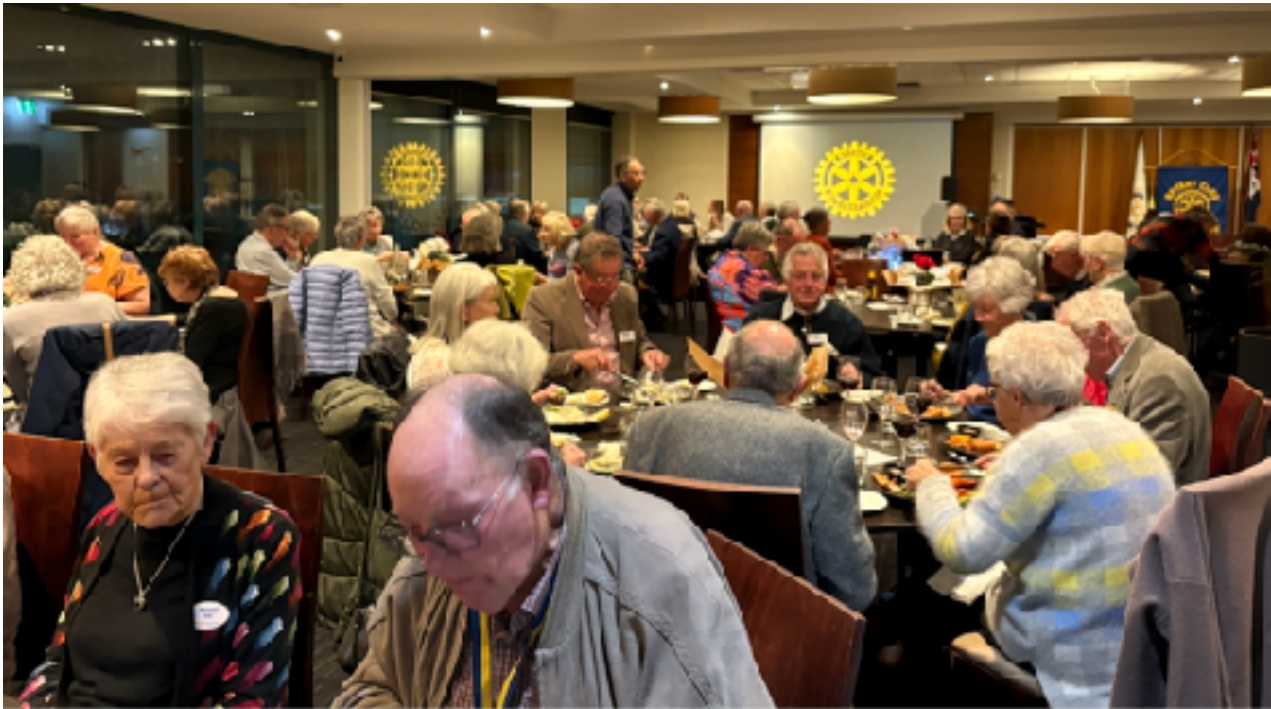
A great meal - well served and delicious !