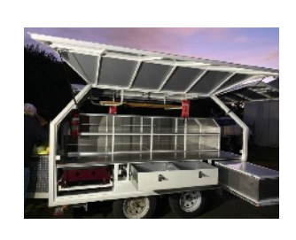
Serve to change lives