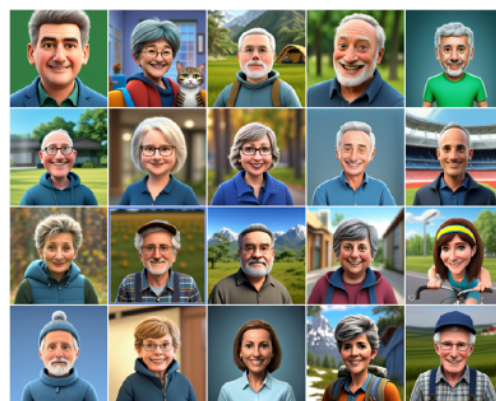
How many can you recognise ?

Bellarine North are having their 50th Anniversary celebrations. Follow the contact details if you would like to attend.