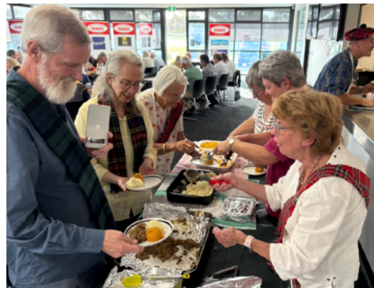
Wonderful food and service