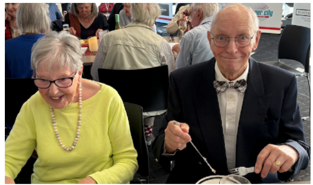
Fred & Wilma were 'choofed'!