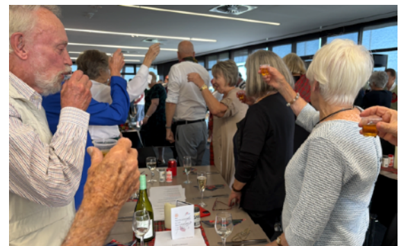
And there were Scottish Poems, Graces, Songs, Toasts and pipes a'plenty.