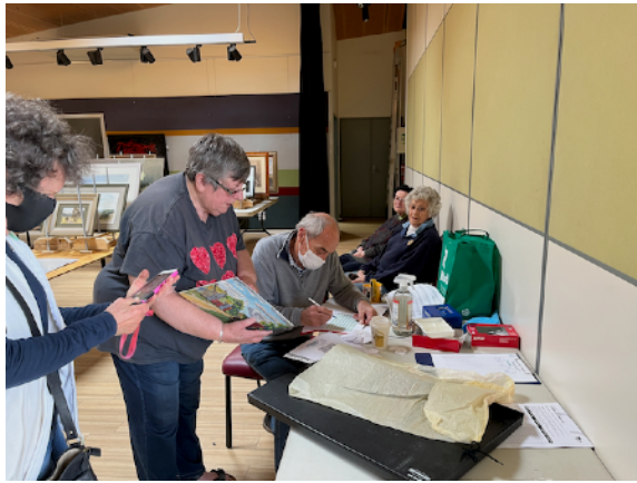
Pre-loved Art Sale