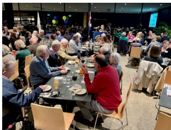
Rotarians and Dinner Guests