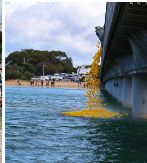
Yellow Ducks Away