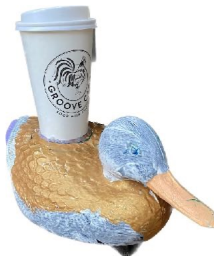
Our Favourite Coffee Duck