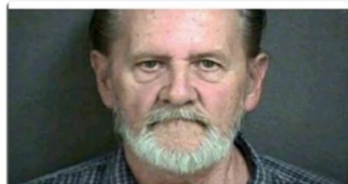
Man who robbed a bank to escape his wife is sentenced to house arrest The Independent

Insane Internet Headlines @IHHeadlines · Follow