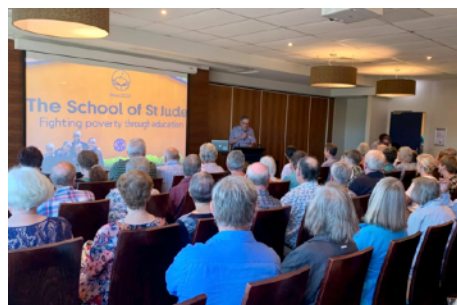
Quite a crowd ..