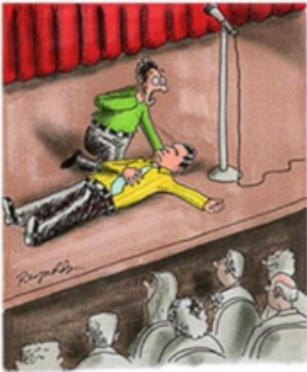
"Is there a health-care representative in the house?!"