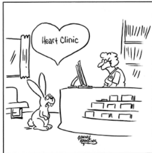
"Did I hear somebody mention a carroted artery?"