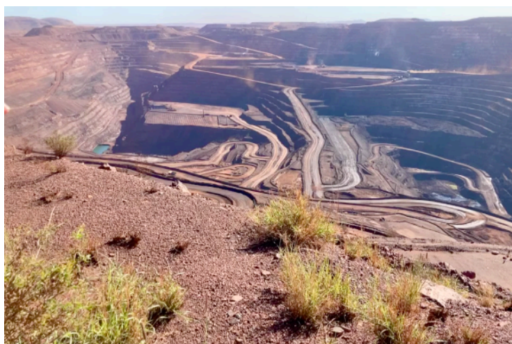
BHP's Mt Whaleback, Newman, world's largest iron ore mine

Driftwood Cafe, OG Cellars, Ian Pattison Jewellers, Piping Hot Chicken Shop, Viewpoint Digital Media, OG Bar, Wardrobe by the Sea, Bellarine Eye care, Bay IT, Bells by the Beach, Laminar, Wish Fish, OG Hardware, OG NewsXPress, Pavilion Property, Cleo Fine Jewellery, Ocean Eyes, OG Super Toys, Covenant Wine Bar, Roche Accounting, Bakers Delight