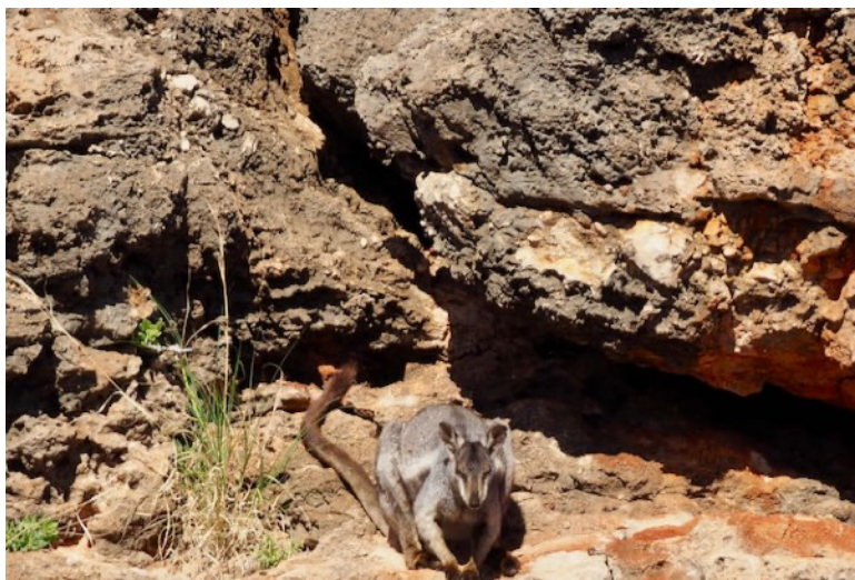
Rare black-footed rock wallaby, Yardie Creek Gorge, Cape Range National Park, W.A.