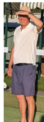
What's that little white ball for?