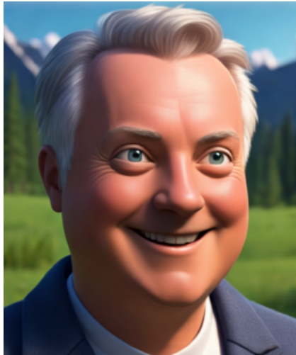
AI image of the week - Who is it ?