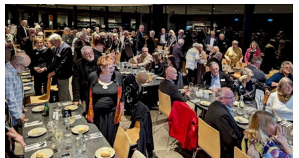
The multitudes assemble at the beginning of the night