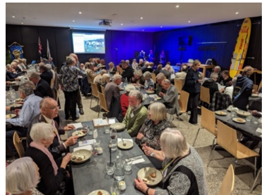
Rotarians and guests enjoying an excellent dinner