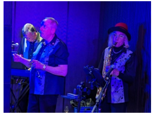
The Band played on: Jazz on C