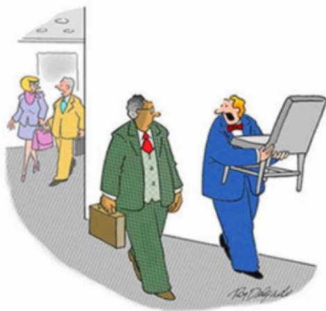
"What did you take away from the meeting?"